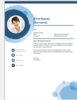
Blue spheres cover letter