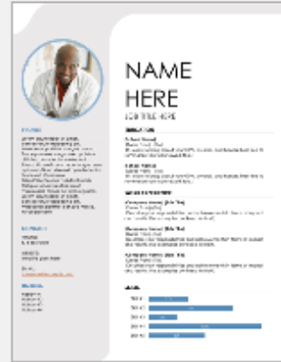
Bold modern resume