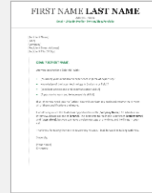
Modern chronological c...