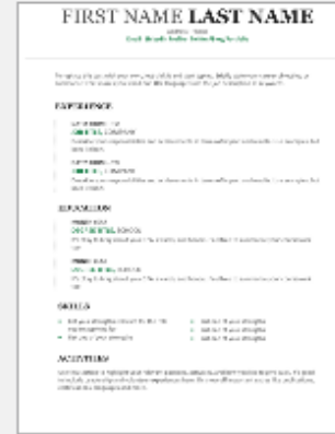
Modern chronological r...