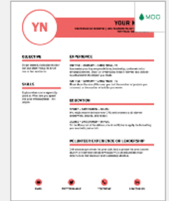
Polished resume, desig...